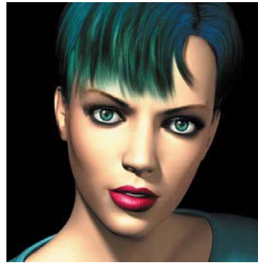
Ananova News reader ( www.ananova.com )

example the simulated robotic agent Ananova ( www.ananova.com ). Ananova was designed to deliver news over the web just as a news anchor might on TV. While it is not a physically embodied robot, it has the simulated morphology of a human and is capable of using the same models of emotion and expression that are designed for embodied robots. In fact, given the physical limitations of robots, the simulation is far more realistic (see picture on right).