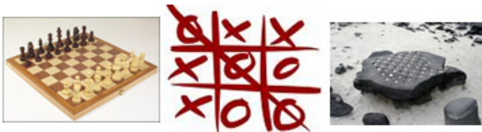
Two-person zero-sum games: Chess, Tic Tac Toe, Konane

In the early history of AI, scientists posed several challenging tasks which if performed by computers could be used as a way of demonstrating the feasibility of machine intelligence. It was common practice to think of games in this realm. For example, if a computer could play a game, like chess, or checkers, at the same level or better than humans we would be convinced into thinking that it was indeed feasible to think of a computer as a possible candidate for machine intelligence. Some of the earliest demonstrations of AI research included attempts at computer models for playing various games. Checkers and chess seemed to be the most popular choices, but researchers have indulged themselves into examining computer models of many popular games: Poker, Bridge,