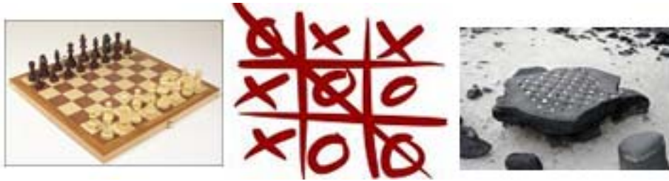
Two-person zero-sum games: Chess, Tic Tac Toe, Konane

in this realm. For example, if a computer could play a game, like chess, or checkers, at the same level or better than humans we would be convinced into thinking that it was indeed feasible to think of a computer as a possible candidate for machine intelligence. Some of the earliest demonstrations of AI research included attempts at computer models for playing various games. Checkers and chess seemed to be the most popular choices, but researchers have indulged themselves into examining computer models of many popular games: Poker, Bridge, Scrabble, Backgammon, etc.