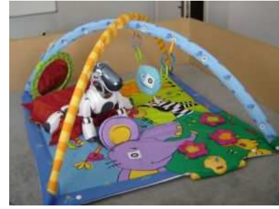
Figure 1: The Playground Experiment

Motor control. The robot is equipped with three basic motor primitives: turning the head, bashing and crouch biting. Each of them is controlled by a number of real number parameters, which are the action parameters that the robot