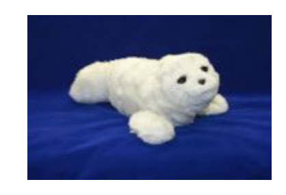
The Paro Baby Seal Robot.

If you hold the Scribbler in your hand and take a look at it, you will notice that it has three wheels. Two of its wheels (the big ones on either side) are powered by motors. Go ahead turn the wheels and you will feel the resistance of the motors. The third wheel (in the back) is a free wheel that is there for support only. All the movements the Scribbler