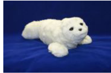
The Paro Baby Seal Robot.

forward (SPEED, SECONDS) backward (SPEED, SECONDS) turnLeft (SPEED, SECONDS) turnRight (SPEED, SECONDS)