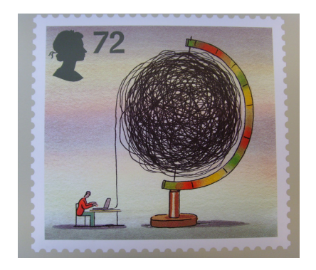
A Postage stamp titled World of Invention (The Internet) was issued by UK's Royal Mail on March 1, 2007 honoring the development of the World Wide Web.

The relationship between robots and computers is the basis for the use of the phrase automatic controls in describing a robot. Automatically controlling a robot almost always implies that there is a computer involved. So, in the process of learning about and playing with robots you will also uncover the world of computers.