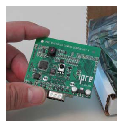
The Fluke Dongle adds Bluetooth and other capabilities to the Scribbler.

In a typical session, you will start the Python software, connect to the robot through the Myro library, and then control the robot through it. We have set up the system so that all communication between the computer and the robot occurs wirelessly over a Bluetooth connection. Bluetooth technology is a common wireless communication technology that enables electronic devices to talk to each other over short distances. For example, Bluetooth is most commonly used in