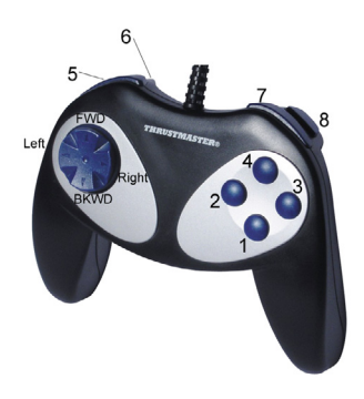
The game pad controller.

In this exercise, we will introduce you to a way of making the robot move about in its environment manually controlled by a game pad device (see picture on right). As above, place the robot on an open floor, turn the robot on, start Python as above and connect to the robot. You may already have this from Exercise 2 above. Also, plug the game pad controller into an available USB port of your computer. At the prompt, enter the following command: