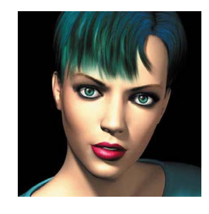
Ananova News reader (www.ananova.com)

example the simulated robotic agent Ananova (www.ananova.com). Ananova was designed to deliver news over the web just as a news anchor might on TV. While it is not a physically embodied robot, it has the simulated morphology of a human and is capable of using the same models of emotion and expression that are designed for embodied robots. In fact, given the physical limitations of robots, the simulation is far more realistic (see picture on right).