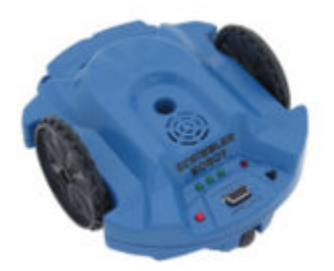
The Scribbler Robot

The scribbler robot, shown here is also a rover. It can move about in its environment. The wheels, and its other functions, can be controlled through a computer via a wireless interface. Your laboratory assistants will provide you with a Scribbler and the required components to enable wireless