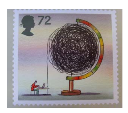
A Postage stamp titled World of Invention (The Internet) was issued by UK's Royal Mail on March 1, 2007 honoring the development of the World Wide Web.

In the last few decades computers have become increasingly ubiquitous. Most likely you are reading this sentence on a computer. If you're reading this text online, the text itself is coming to you from another computer (located somewhere on the western banks of the Delaware River in south-eastern parts of the state of Pennsylvania in the United Stated of America). On its journey from the computer in Pennsylvania to your computer, the text has probably traveled through several computers (several dozen if you are outside the state of Pennsylvania!). What makes this journey of this text almost