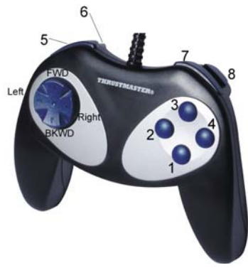
The game pad controller.

In this exercise, we will introduce you to a way of making the robot move about in its environment manually controlled by a game pad device (see picture on right). As above, place the robot on an open floor, turn the robot on, start Python as above and connect to the robot. You may already have this from Exercise 2 above. Also, plug the game pad controller into an available USB port of your computer. At the prompt, enter the following command: